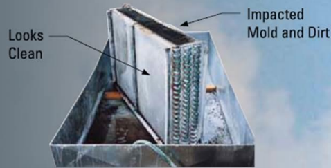
Removed Coil Shows Power Washes Fail