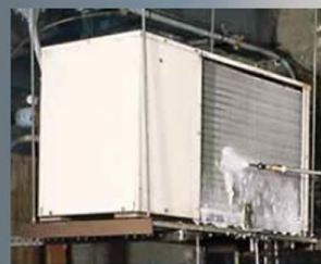
Power Washes = High Expense and System Down-Time